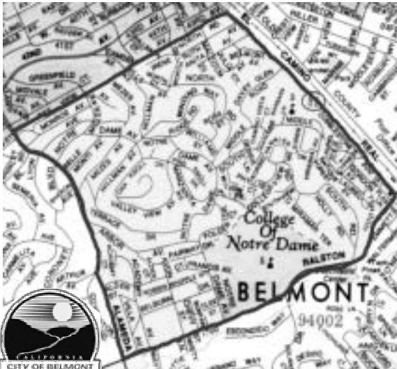
Mailing Address Label

YOU ARE RECEIVING THIS NEWSLETTER BECAUSE YOU LIVE WITHIN THE CNA BOUNDARIES OUTLINED BELOW: